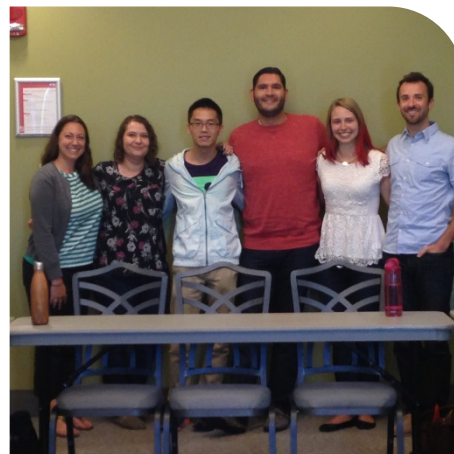
Incoming PhD Cohort at Orientation