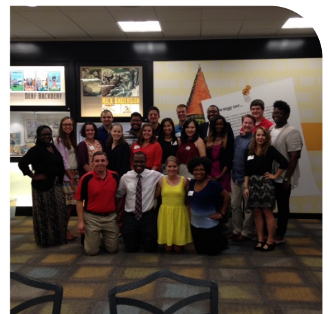
Incoming MA Cohort at Orientation

This year's orientation was supplemented by the great energy of the HESA student organization, HESPA, who coordinated a variety of social events to help new students get to know each other and returning students. These events included the annual HESPA welcome BBQ, an evening of games at Kingmakers in the Short North, and a dinner at Bakersfield.